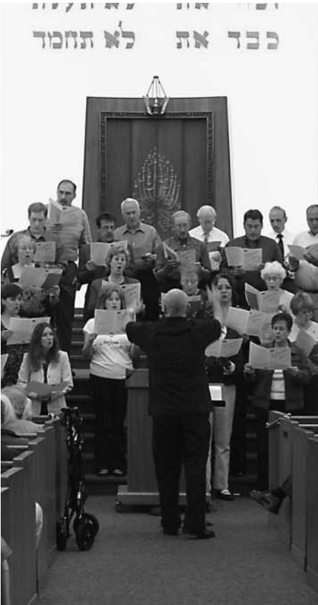
Berkely Interfaith Choir

Huntington Woods, MI 48070 P.O. Box 7011